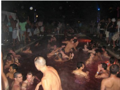
Roland Emmerich and Bryan Singer's 2009 Post-Pride Party